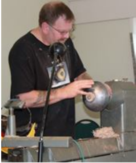
The pewter finish