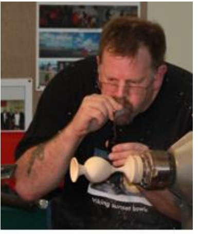
Spots for background