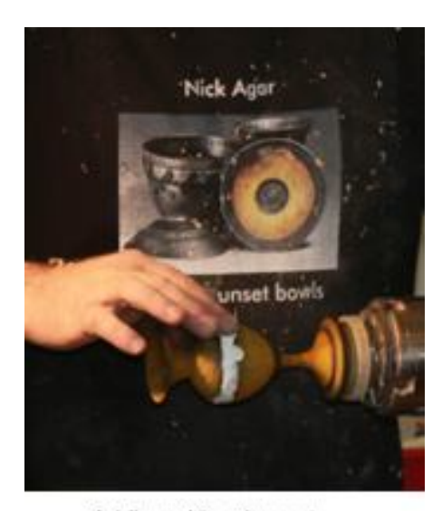
Adding white pigment