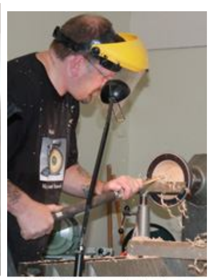
Finishing cut on the inside